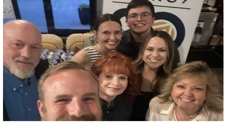
Above: Impromptu selfie with KPP members & staff.