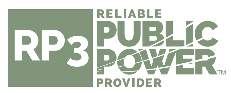
American Public Power Association

Congratulations to the City of Winfield on this significant achievement and designation.