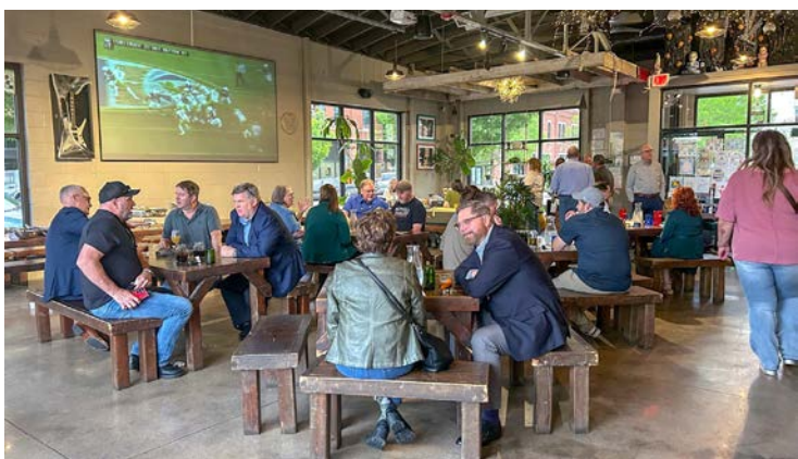
Above: KPP Members gathered for food, drink & networking.